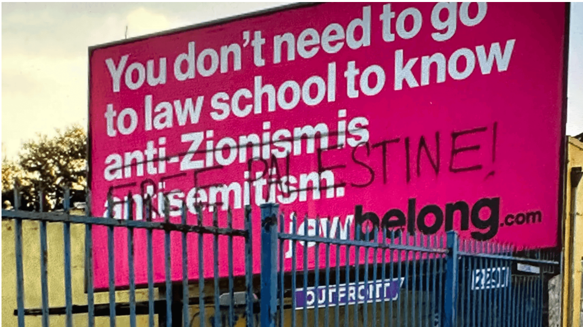
JEWBELONG BILLBOARD AT SAN PABLO AVE. AND HEARST ST. IN BERKELEY.

In last week's newsletter we covered billboards that were recently launched by the group JewBelong in Berkeley. “You don't need to go to law school to know anti-Zionism is antisemitism,” reads their text. It's a reference to a phony narrative pushed by pro-Israel groups about a Berkeley Law student organization's anti-Zionist bylaw.